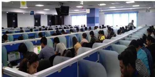
JEE Advanced 2019

Soon after the announcement of HRD Ministry regarding the extension of deadline for the online registration process of JEE Advanced 2019, the Indian Institute of Technology established a special help desk for the students belonging to Odisha state. An official of IIT Bhubaneswar said that, the help desk will operate from the E-class room and Lab Complex (LBC) in the permanent campus. On May 7, the Union HRD Minister, Prakash Javadekar has directed the IIT, Bhubaneswar to help aspirants from Odisha in online registration for JEE Advanced Examination 2019 as the institute has fully functional internet connection.